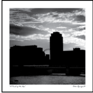
TL-12 'A Peek of the Eye'