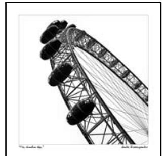
TL-03 'The London Eye'