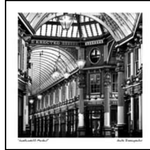
TL-04 'Leadenhall Market'