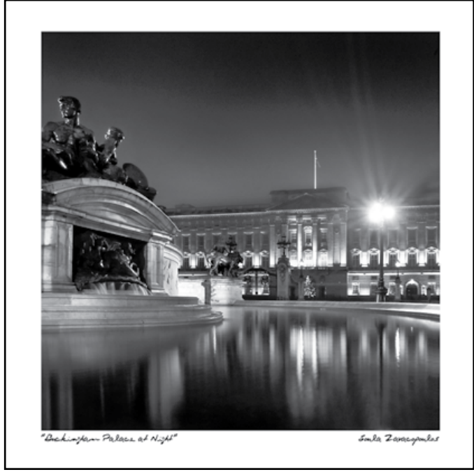
"Buckingham Palace at Night" Soula Zavacopoulos