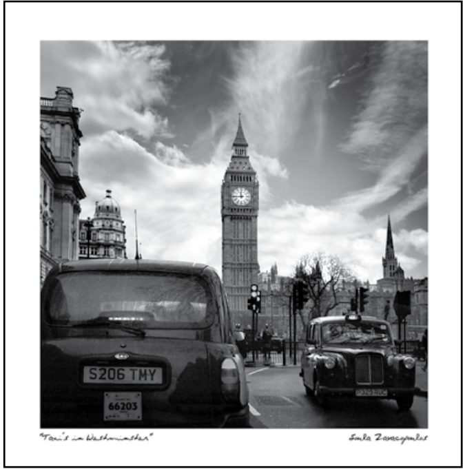
TL-21 'Taxis in Westminster'