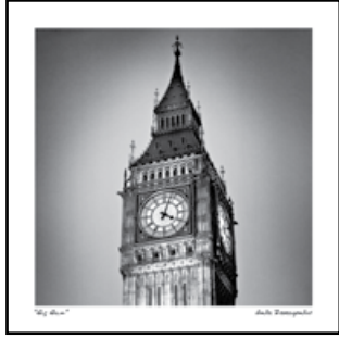
TL-18 'Big Ben'