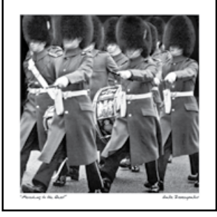
TL-05 'Marching to the Beat'