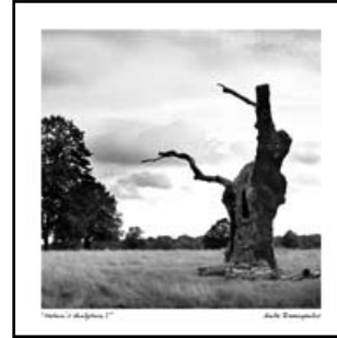
TL-15 'Nature's Sculpture'