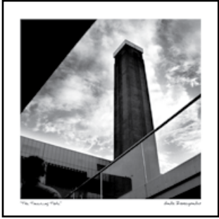
TL-08 'The Towering Tate'