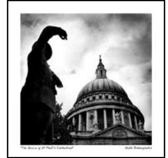
TL-02 'The Dome of St Paul's'