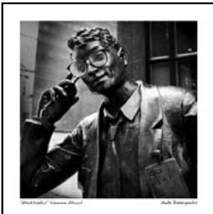
TL-09 'Stocktrader, Cannon Street'