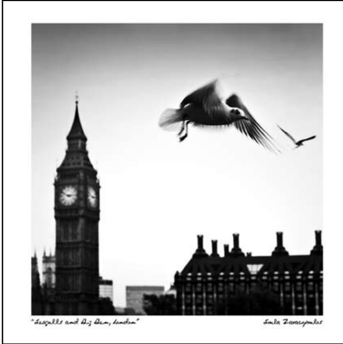
TL-06 'Seagulls and Big Ben'