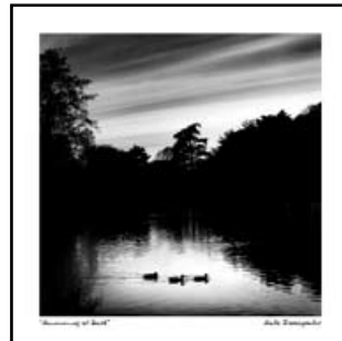
TL-13 'Swimming at Dusk'