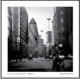
TL-10 'The Gherkin from Aldgate'