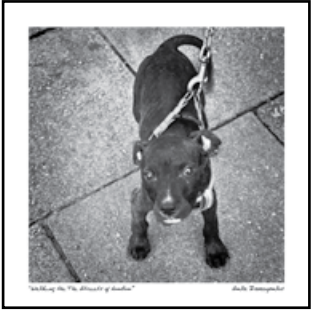
TL-16 'Walking the Streets of London'