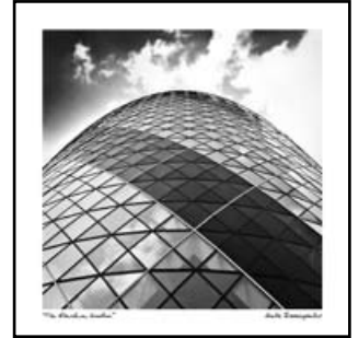
TL-01 'The Gherkin'