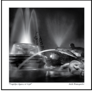
TL-17 'Trafalgar Square at Night'