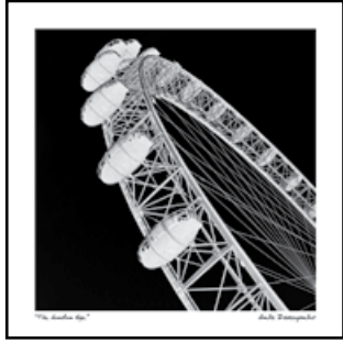
TL-17 'The London Eye'