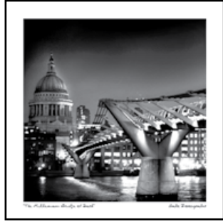
TL-07 'The Millennium Bridge at Dusk'