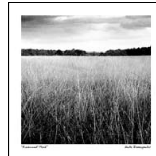
TL-14 'Richmond Park'