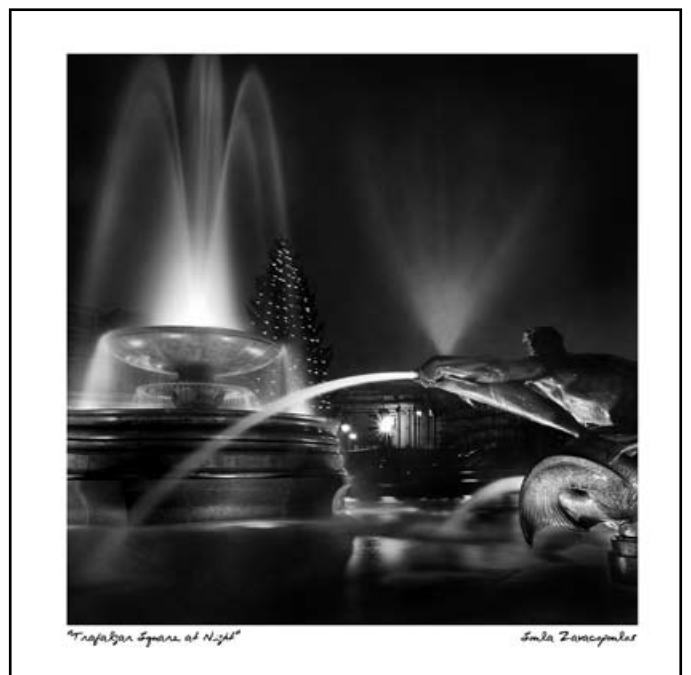
TL-17 'Trafalgar Square at Night'